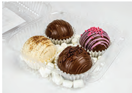
Clear Hinged Containers