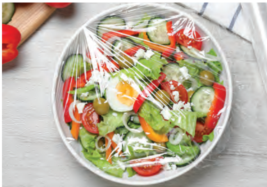
Food Service Film