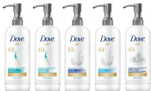
8.11 oz Dispensers

Our caring formula delivers nourishment that goes deep into your skin and hair. Gender neutral and loved by all, with our signature Dove scent. Shampoo | Conditioner | Body Wash | Hand Wash | Body Lotion | 25g beauty cream bar