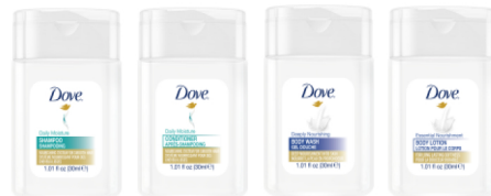
1 oz Minis