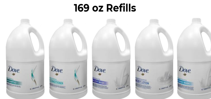
169 oz Refills