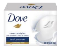
.88 oz Beauty Bar